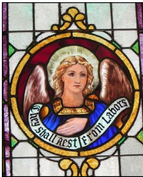
The stained-glass window shown above is in St. Mary's Chapel at Holy Cross Cemetery. Consecrated in 1901, the cemetery has served local Catholics for 112 years.

Join SHHS Today! See the website for details.