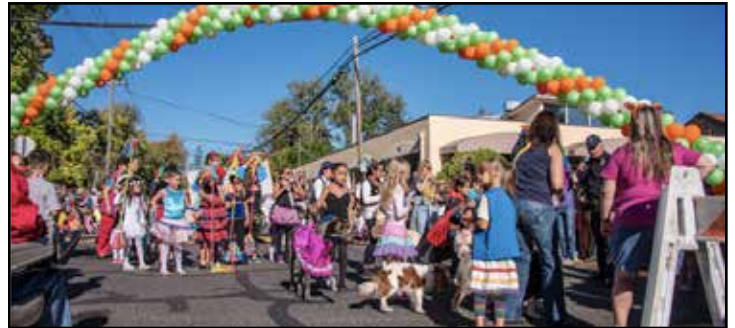
St. Helena Hometown Harvest Festival

Thank you to all our members for your continuing support.