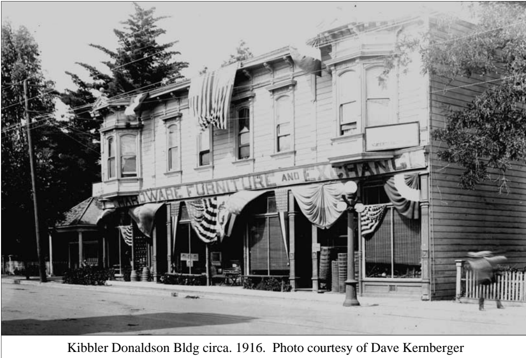
Kibbler Donaldson Bldg circa. 1916.

A severe attack of blood poisoning, possibly from embalming chemicals, left him very weak. While recovering, he recalled his Napa Valley trip and decided to move to St. Helena. A man of quick action, he and his family relocated to St. Helena by August, 1891. Here, he purchased the furniture/undertaking