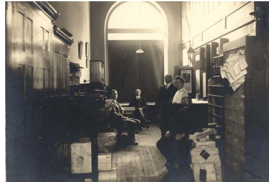
Interior, St. Helena Star Building, ca 1910

Newsletter of the St. Helena Historical Society, Summer 2003