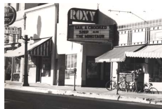
Roxy Theatre, ca 1961.